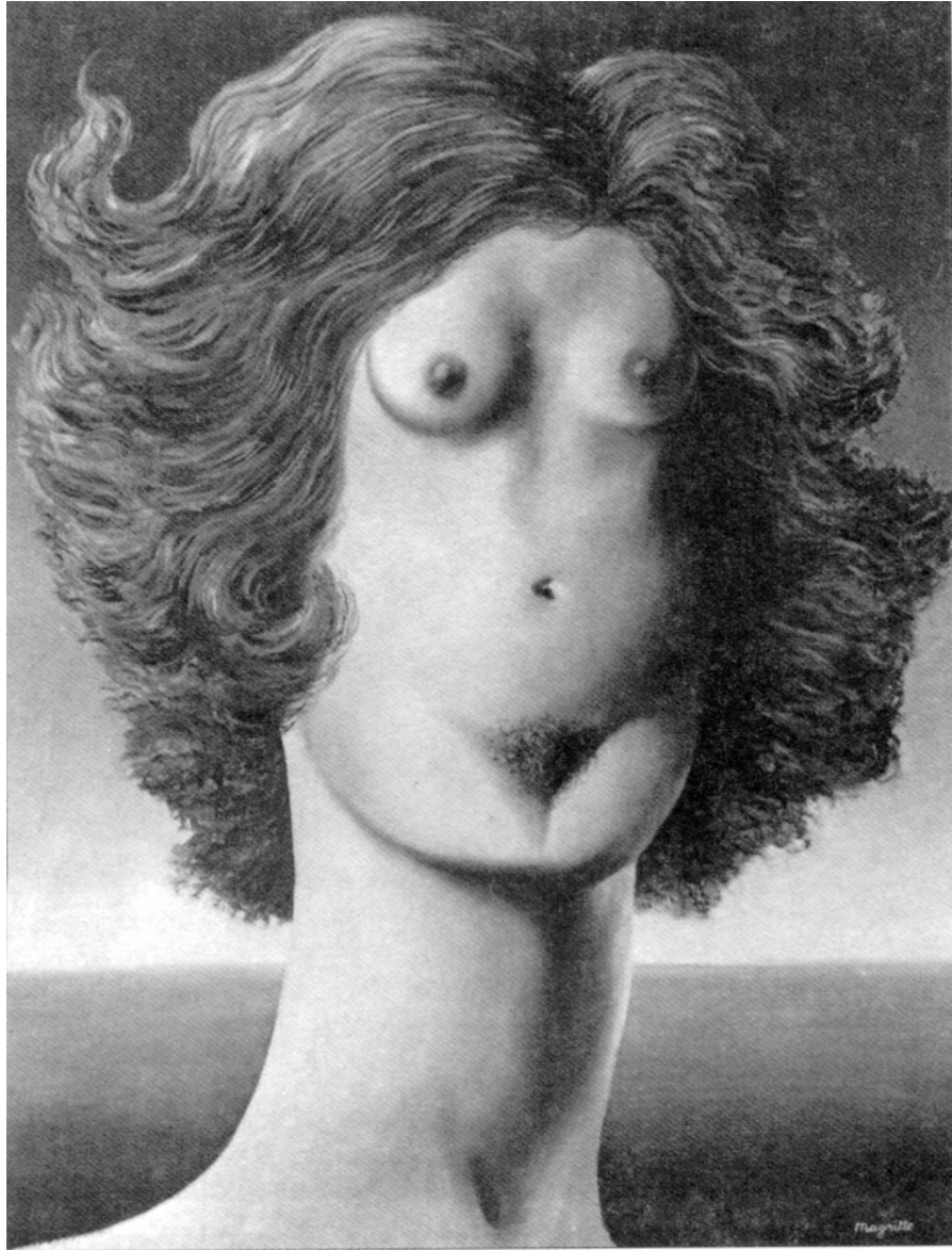
René Magritte, Lo stupro , 1934, Londra, Collezione Gorge Melly.